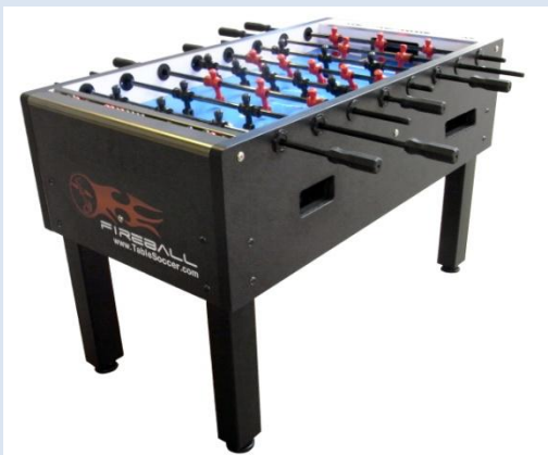
3 MAN GOALIE USA PRO

Fireball Tables will be for sale at the conclusion of the tournament. Contact Mike or Brad for details.