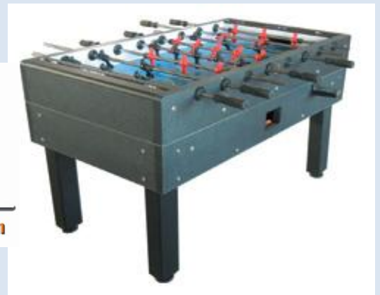
COIN-OP 3 MAN GOAL USA PRO